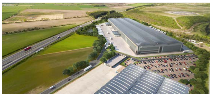
Doncaster where a 0.4m sq ft, sustainable distribution hub will be built and pre-let to B&Q.