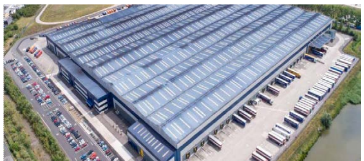
Accolade Wines, Avonmouth, Europe's largest wine production, warehouse and distribution centre.